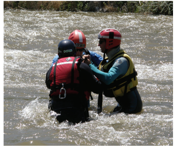
Three person river crossing