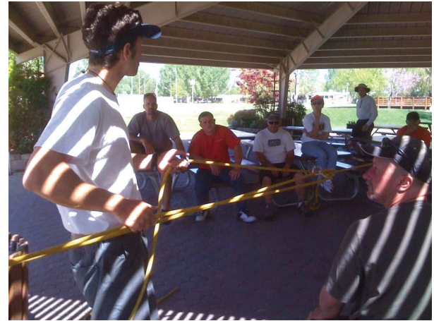
Rope and anchor basics

and self survival with personal rescue swimming, defensive swimming and live bate rescue. This course was an evening didactic class and two full days of on and in the water training. Also, as it turned out, the Carson River was at it's highest level all season, reaching a flow of 2000 cubic feet per second, and depths of up to 5 feet. Members and instructor gained a great respect of the power of the river that weekend. A great thanks goes out to Jonathon Blum for his expert knowledge and sense of adventure.